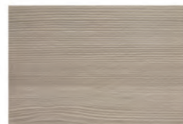
Just Like Fir