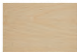
Hard Rock Maple